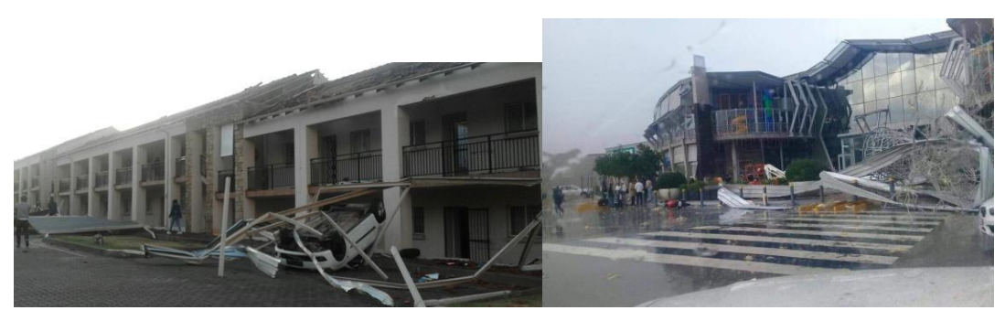
Figure 1: (left) An apartment complex in Fourways significantly damaged by the storm. (right) portion of the Cradlestone Mall that collapsed.